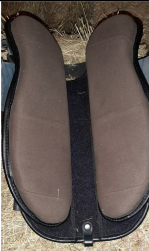
too far to the front