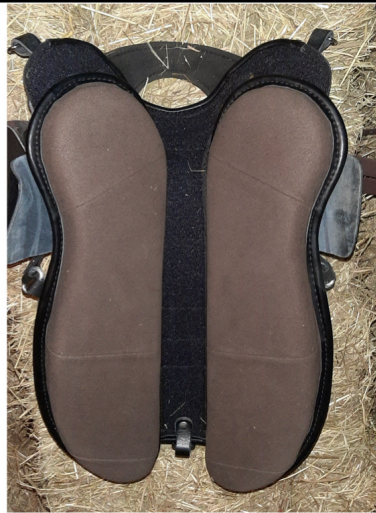
too far to the rear